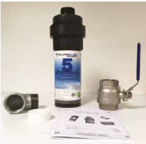
5 litres/minutes water flow rate by gravity

FILTRELEC® is a technical and economical field proven alternative to traditional oil/water physical separators.