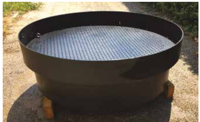
1500 litres/minutes water flow rate by gravity