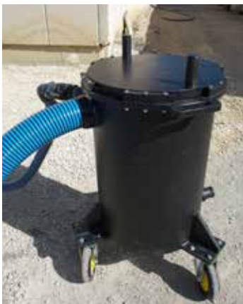
Portable filtration device – 50 litres/minute using a transfer pump