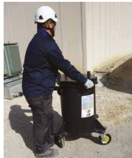
Handling by a single operator