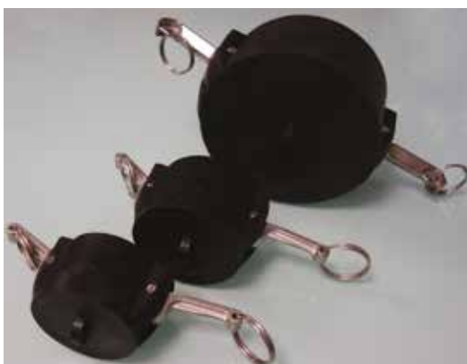
Nozzle plugs for transportation