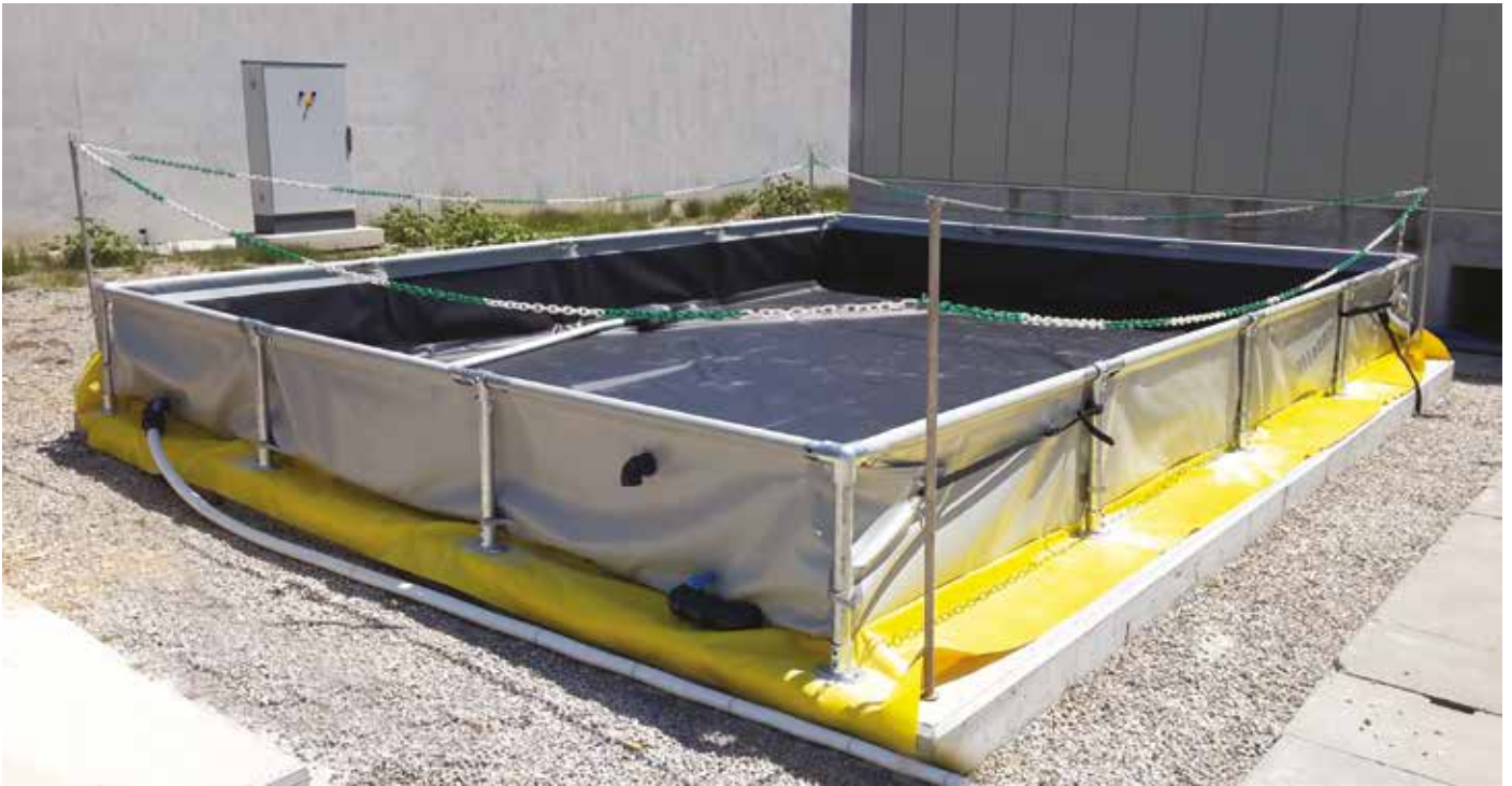
BSTUB: temporary storage of oil immersed electrical transformers