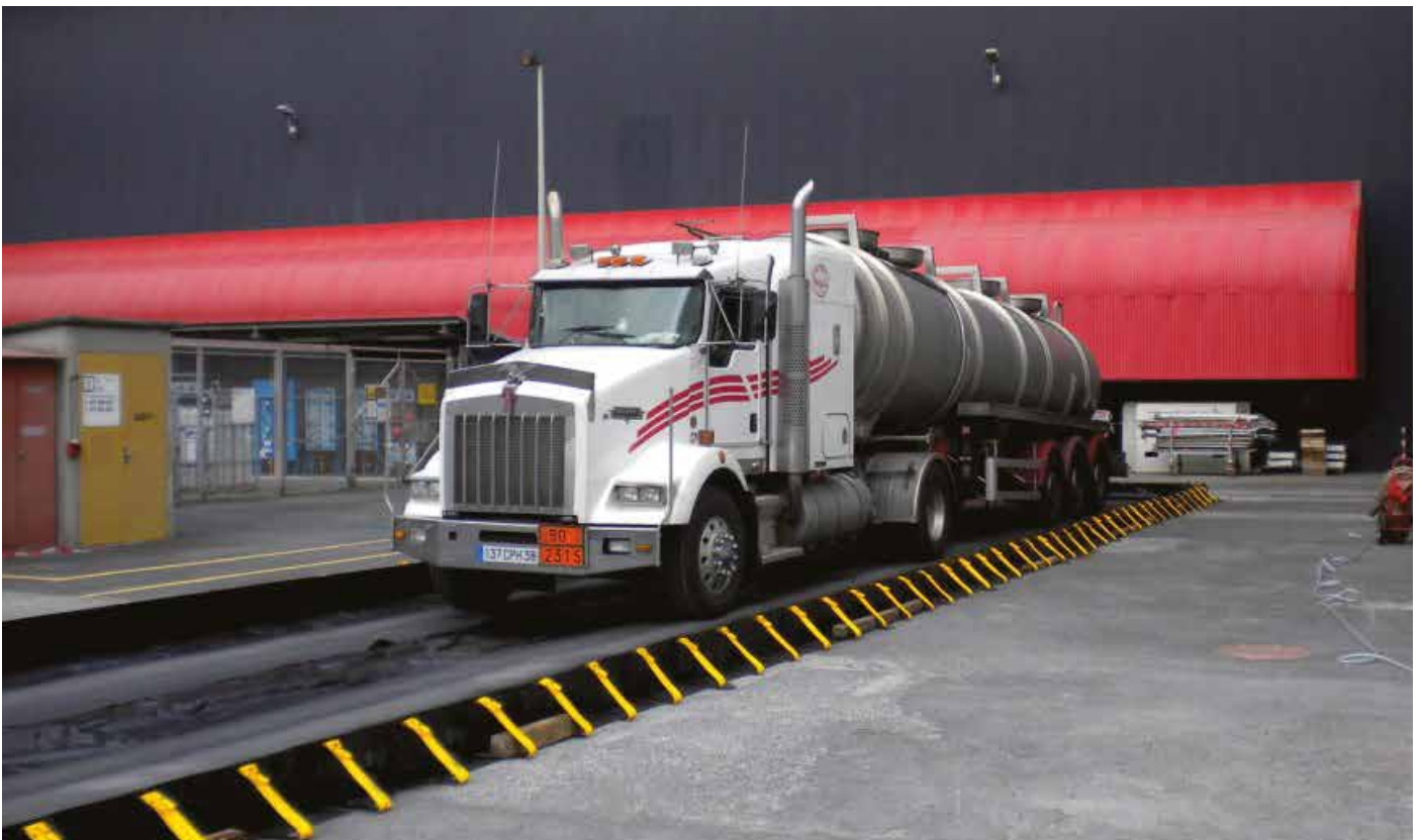
BCAM: environmental protection of heavy duty vehicles, mobile transformers...