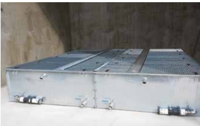
Total retention of dielectric