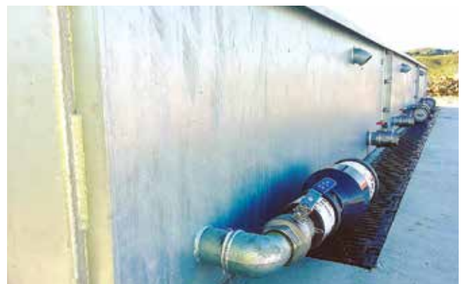
Continuous rainwater filtration and draining